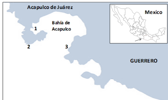
Figure 1. Location of sampling stations (1–3) in Bahía de Acapulco, Guerrero, surveyed on 26 January 2012.

Total abundance and the contribution of each microalgae species during the red tide are summarized in Table 1. The predominant species was Gyrodinium instriatum ( 2120 \times 10^3 cells L^{-1} ; Figs. 3-4), followed by other dinoflagellates such as Gymnodinium catenatum ( 197 \times cells L^{-1} ; Fig. 5), Noctiluca scintillans ( 613 \times 10^3 cells L^{-1} ; Fig. 6), and the diatom Guinardia delicatula ( 83 \times 10^3 cells L^{-1} ). Seawater temperature varied from 27 °C in 19 June and 26.3 °C in 27 June (Fig. 7). Average temperature and salinity ( in situ ) were 24.4 °C and 33.13 , respectively. Turbidity, measured with a Secchi disc, ranged from 3–5 m (Table 1). Concentrations of nutrients during the bloom ranged from 0.27 – 0.7 \mu M PO_4 , 1.04 – 2.2